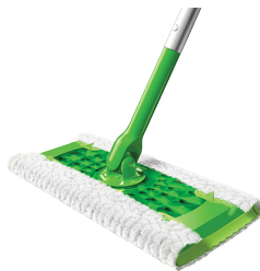
1 x Swiffer pole